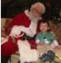
The Preschool Children enjoyed a visit from Santa after their Holiday musical